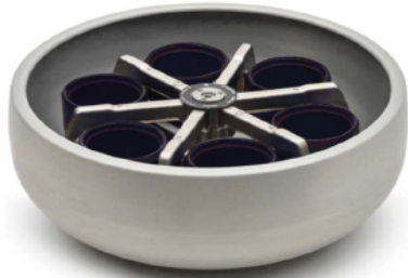
HAEMAFlex 6 Swinging Bucket Rotor

For the 600 mL bottle, it would be these two rotors along with the buckets and adapters: