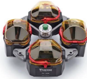
TX-1000 4 x 1000mL

TX-1000, adapters, buckets, and bio lids for the smaller units to accommodate 400-450 mL Bioreactor Tubes.