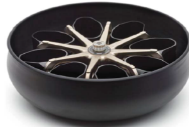
HAEMAFlex 8 Swinging Bucket Rotor